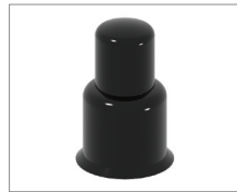
Telescopic Cap (TSW)