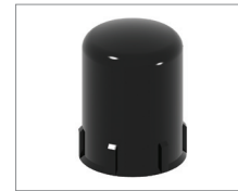
Bolt Cap (BM)