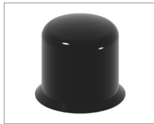
Locking Cap (SW)