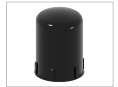
Bolt Thread Cap (B)