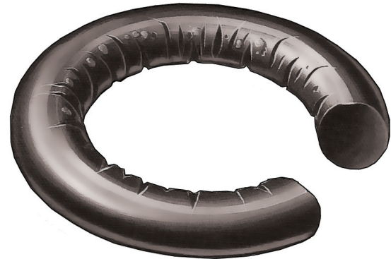
Rendering of thermal degradation

As industries develop and attempt to decrease production times, the sealing industry is seeing increased pressure to develop new products to meet higher heat and more aggressive chemicals. In addition, increased design expertise is required to understand the mechanics to allow seals to perform at their best.