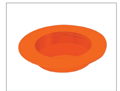
Valve Flange Protector (FP)