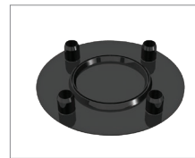
Stud Hole Flange Protector (FC)