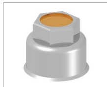
Wedge Cap (KSW)