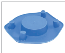
Bolted Flange Protector (BFP)