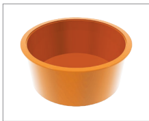
Caps & Plugs (CP)