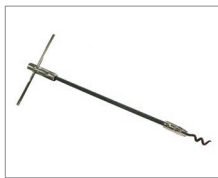
Braided Packing Extractors