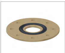
Full Face Trojan® Gasket